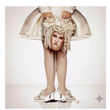
Royal Blood, Marie-Antoinette, † 1793, 2000, Erwin Olaf