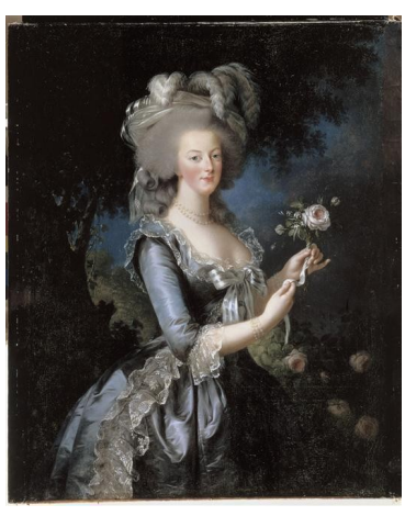
Portrait of the Queen Marie-Antoinette «with a rose », Élisabeth Vigée Lebrun, 1783, Château de Versailles