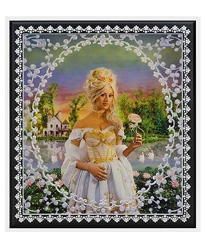
Marie-Antoinette: The Hamlet of the Queen, By Pierre et Gilles, 2014