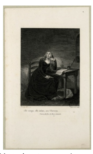
Marie-Antoinette at the Conciergerie: "she cut her hair herself" Lefèvre, 18th century, Château de Versailles