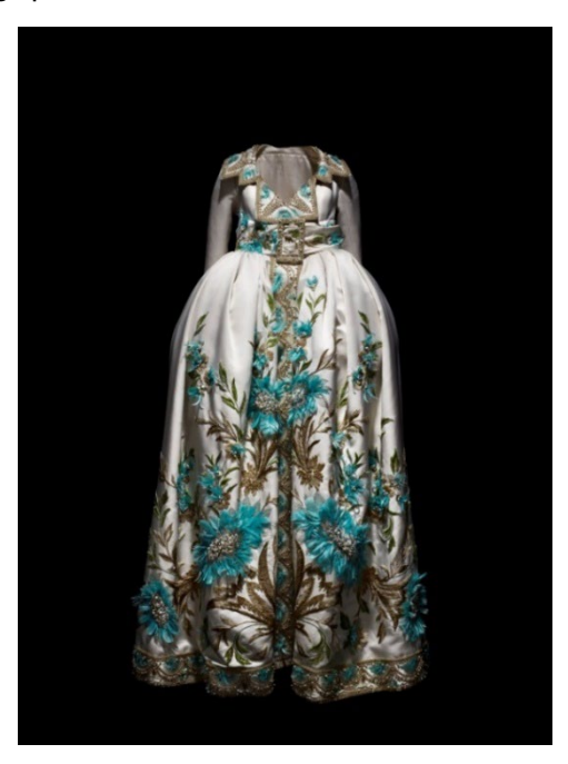
Coat-dress, Passage 43, Spring Summer 2005 John Galliano, Dior » (retouches are not permitted)