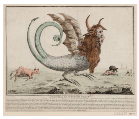
"Description of this unique monster", Joseph-Alexandre Le Campion, estampe, 1784.