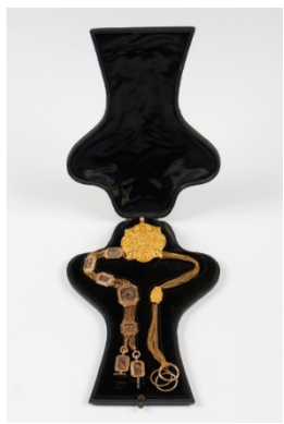
Chatelaine-reliquary of the Duchess of Tourzel, private collection