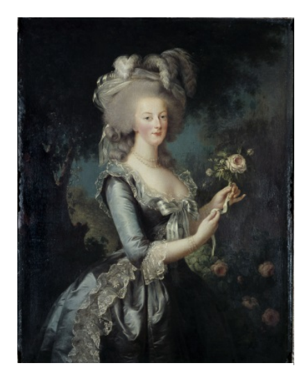
Portrait of the Queen Marie-Antoinette entitled « à la rose » Élisabeth-Louise Vigée-Lebrun, 1783. Château de Versailles