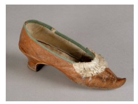
Shoe, Musée des Beaux-Arts de Caen